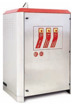
XD-ST Stainless Steel