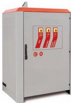
XD-G Galvanised Steel