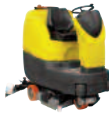
Vision Trak SR 750 CS