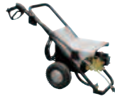
Washman HD / AC