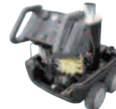
XDL Specialist 3HP / 60Hz