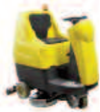
Vision Trak 750X / 29