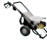
Washman HD / WC