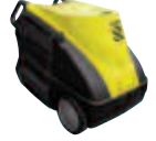
Performance Pro / HT