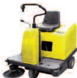
Drive 1000P/38 Drive 1000B/38

Choice of three cleaning widths Choice of power Standard single side brush Shock proof steel frame Wide collection compartment