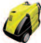
Performance Pro Ultra / 60Hz