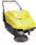
Walkman 700B / 26 Walkman 900B / 34