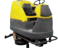
Vision Trak CL 3WD