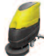
Vision Pro 450E, 500E Vision Pro 450B, 500B, 450BT, 500BT