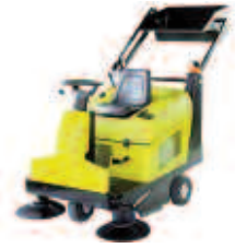
Drive 700T / P Drive 700T / B