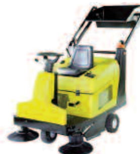
Drive 700T/P Drive 700T/B