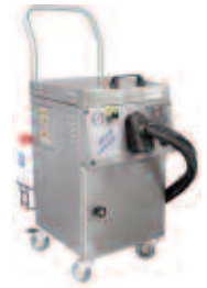
Vision Steam Pro 3300/V Vision Steam Pro 4400/V