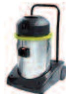
Pro 50 / 1-55 120 / 60Hz