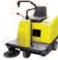
Drive 1000P / 38 Drive 1000B / 38