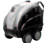
XDL Specialist SP / 60Hz