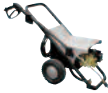
Washman HD / 60Hz