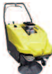
Walkman 700P/26 Walkman 900P/34