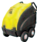
Power Plus XP / 60Hz