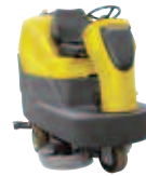
Vision Trak SL 36V