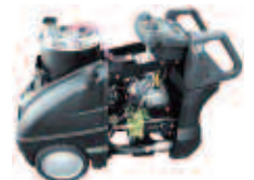
XDT Specialist / 60Hz