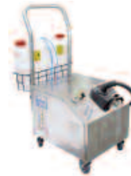
Vision Steam Pro 3300/9

Saturated steam at 9 bar at a temperature of 175°C Steam gun with low tension control Heating and activation time required is 7 minutes. Device for using chemicals and detergents mixed with steam Optional: 10 m or 15 m flexible hose with gun and detergent switch