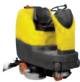
Vision Trak SR 24V