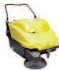
Walkman 700B/26 Walkman 900B/34