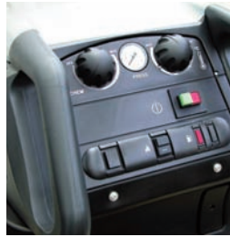
Temperature regulation gauge with high sensitive stainless steel sensor. Low fuel lamp and cut off.