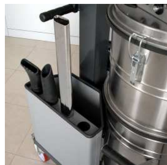
Accessory storage facilities with drip