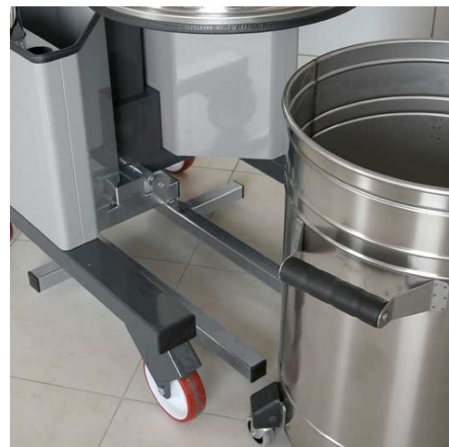
Collector tank lifting lever