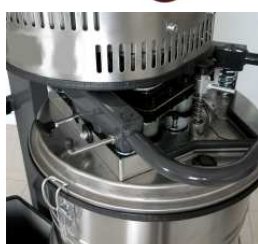
Flow reverser and water ejection control